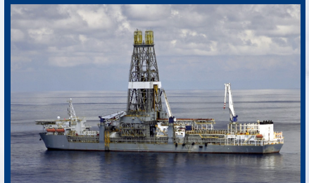
Arbeitsschiff / Work boat