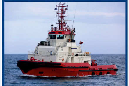
(Hochsee-)Schlepper / (Offshore) tug boat