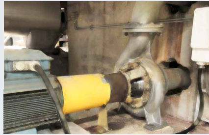
Pump installation at Stora Enso Kvarnsveden

Numerous mechanical seals are installed in stock pumps which are used to transport pulp of varying stock consistency to different parts of the process, for example from the machine chest to the paper machine headbox. Depending on the operating conditions, the level of standardization and preferences, Stora Enso applies single mechanical seals with or without flush or quench, or double mechanical seals with appropriate supply systems. Because reduction of water consumption plays a major role and is a necessity in the pulp & paper industry, plant operators have a keen demand on single seal solutions which normally run in dead-end mode (i.e. without flushing) but can be operated with a flush if required.